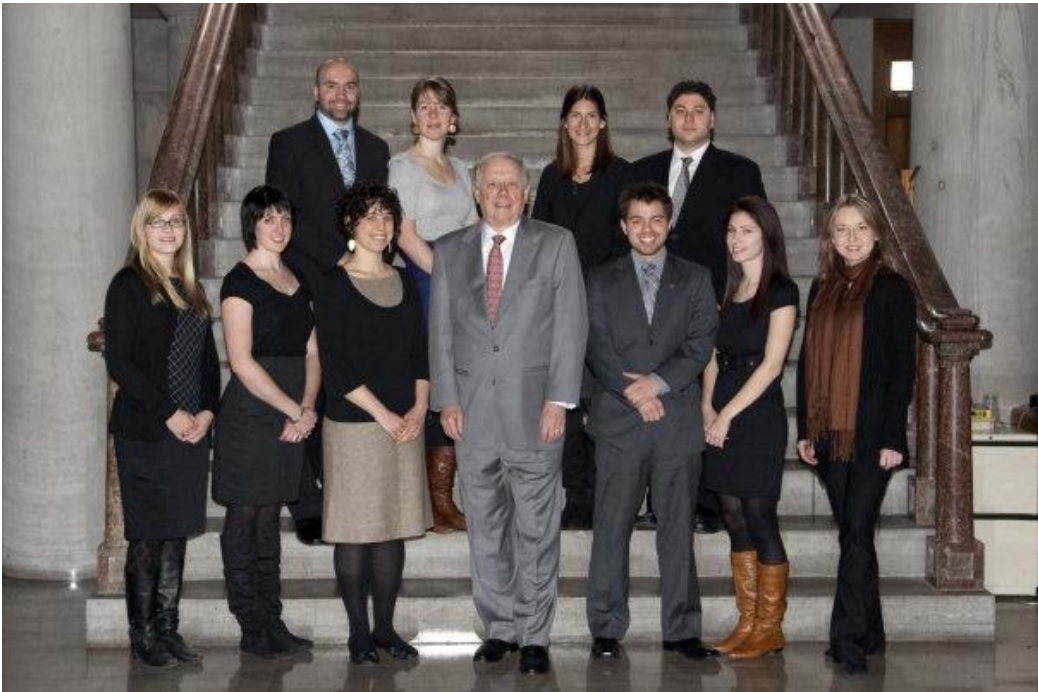
Figure 3 OLIP Interns with Governor of Tennessee Phil Bredesen