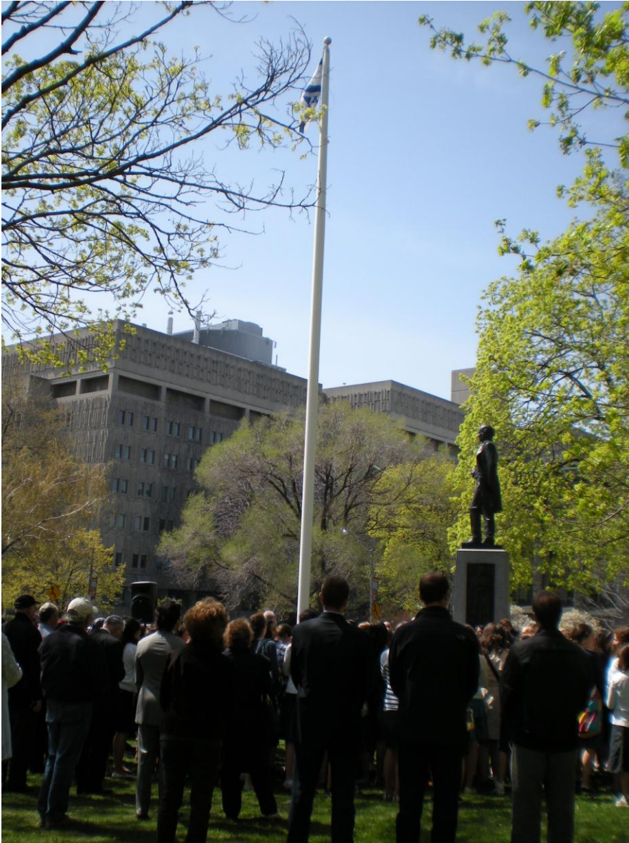
Figure 2 Israeli Flag Raising, April 20th 2010