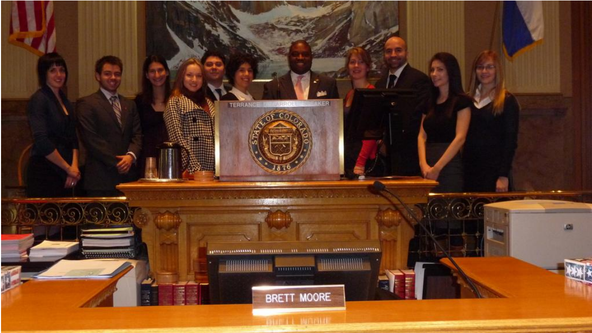
Figure 4 OLIP Interns with Speaker of the Colorado State Legislature Terrance Carroll