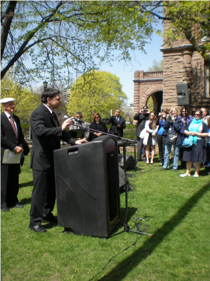
Figure 1 Mr. Amir Gissin, Consul General of Israel, speaking at Flag Raising